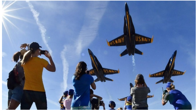
Blue Angels still delight crowds wherever air shows are held.

Middleburg, like much of Clay County, remains a regularly-chosen home for many active-duty and retired military families who make northeast Florida and the Sunshine State their home.