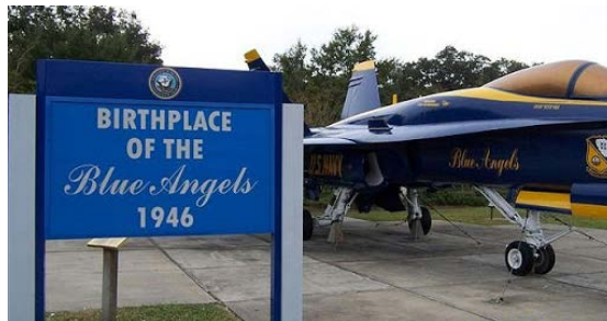
NAS Jacksonville Front Gate

Although Naval Air Station Jacksonville is well-known as the birthplace of the Blue Angels dating back to 1946 and Naval Air Station Pensacola viewed as their current east coast home base, much of the squadron's preliminary training was also – some would say, equally - done at Branan Field OLF.