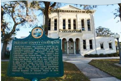
Teen Court is held in this historic courthouse!

Teen Court is a rewarding experience for volunteers. As part of this program participants earn community service hours, make life-long connections and may even become eligible to receive Teen Court scholarships.