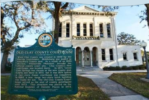
Teen Court is held in this historic courthouse!

Teen Court is a rewarding experience for volunteers. As part of this program participants earn community service hours, make life-long connections and may even become eligible to receive Teen Court scholarships.