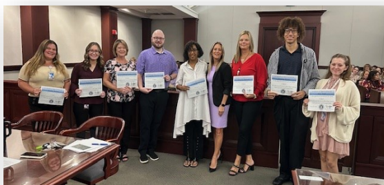
Congrats to these employees on hitting a variety of employment milestones — all were recently recognized at our all-staff meeting.