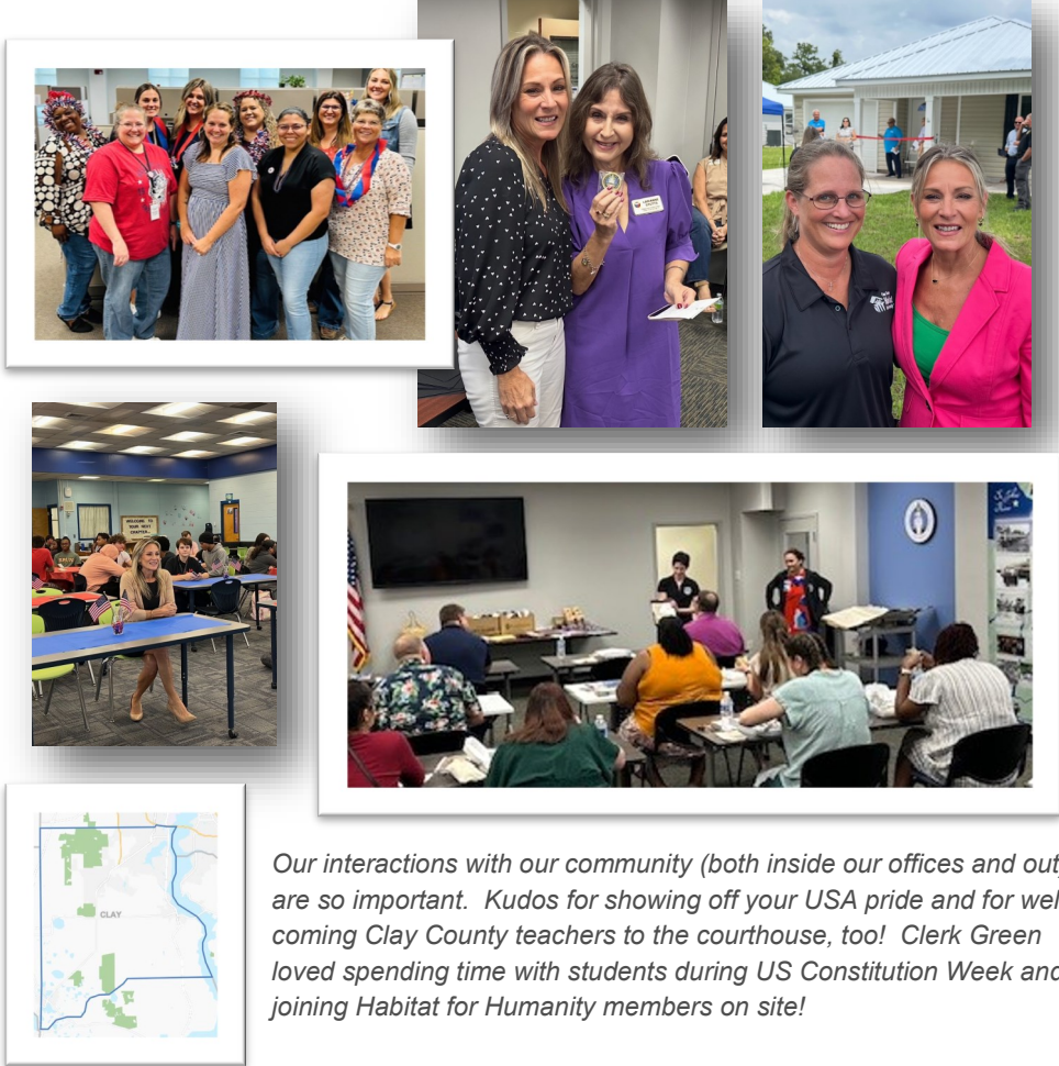
Our interactions with our community (both inside our offices and out) are so important. Kudos for showing off your USA pride and for welcoming Clay County teachers to the courthouse, too! Clerk Green loved spending time with students during US Constitution Week and joining Habitat for Humanity members on site!